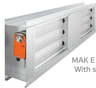
MAK E 16/24 F 01 With spring return (VDI 6022)