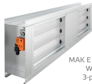
MAK E 16/24 F 02 With actuator 3-point control